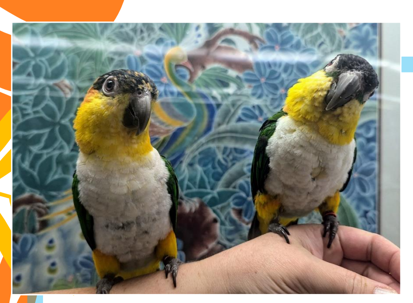
Caiques - Age: 1 year old

She is playful, talkative, and loves to fly and exercise. Lots of wood toys needed, as she loves to play with them!