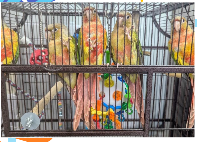
Green Cheek Conures - Ages: 4-5 months

We have 6 remaining Green Cheek Conures: Most of them are Pineapple coloration and 1 is Yellow Sided.