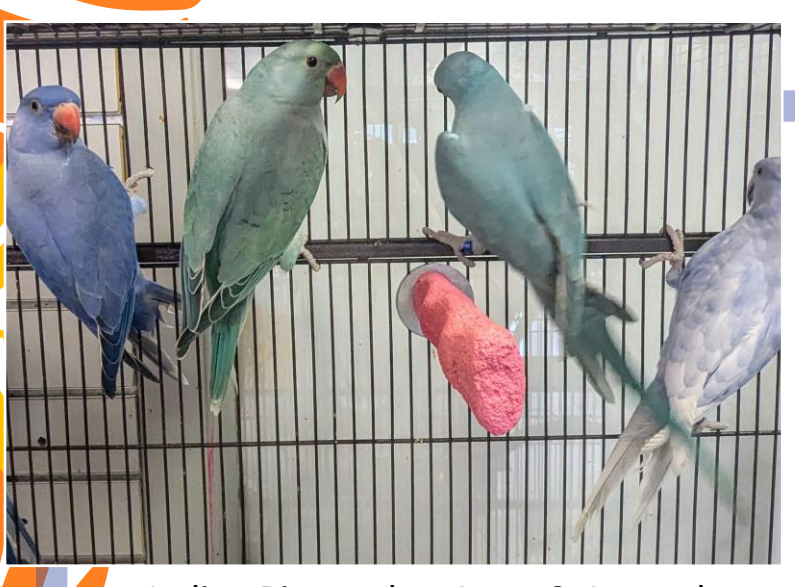
Indian Ringnecks - Ages: 3-4 months

2 Males and 1 female confirmed at this time. 3 more DNA results pending.