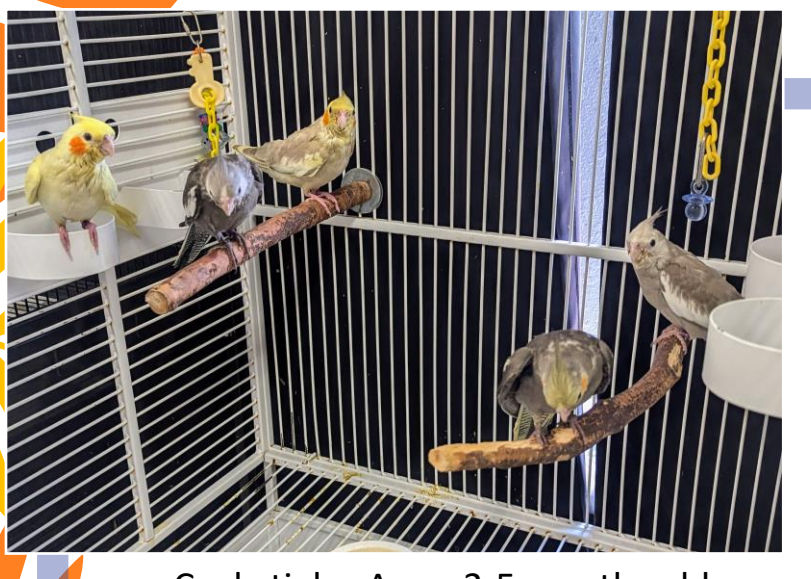
Cockatiels - Ages: 3-5 months old

They are being handfed and weaned onto pellet, seed, and chop.