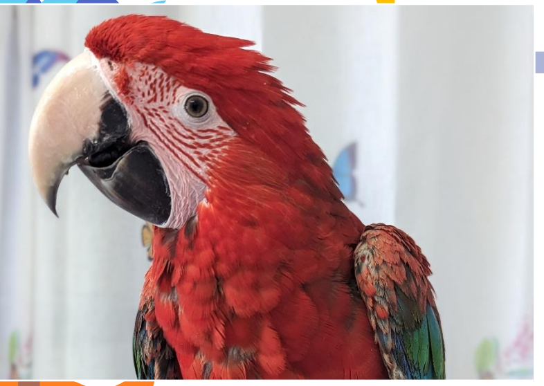
Green Winged Macaw - F - Age: 2 years

We have 1 female Macaw, hand fed, weaned, and raised here at Avalon. She hatched 6/3/22.